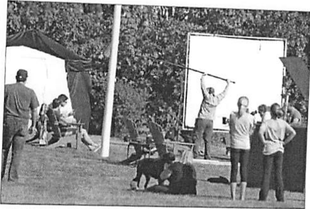
A scene is shot on the front lawn of a home on King Caesar Road.